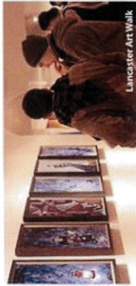
Lancaster Art Walk

Western Sussex County, Delaware, is a land known for two things: a bountiful apple harvest and the